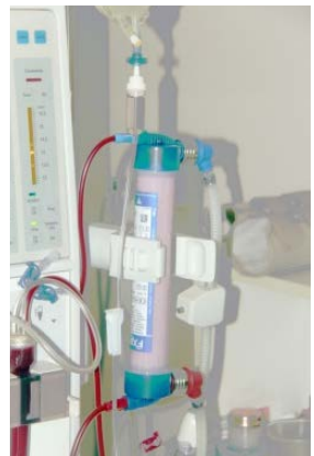
Artificial kidney (dialyser)

Central Venous Catheter (CVC) is another form of access. The CVC line is put in a vein in the side of your neck or upper chest. There is a higher infection risk and it is not the preferred option, especially for home dialysis. If needed, it is a good temporary measure and in special circumstances, may sometimes be used at home with special training.